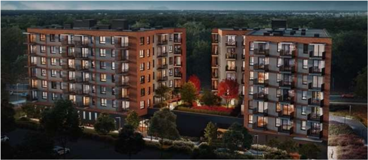
Concept visualisation, Wólczyńska 133, Warsaw, Poland

CeMat is currently negotiating financing of the project with the banks.