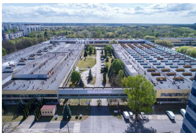
CeMat, Wólczyńska 133, Bielany, Warsaw

Both the SBU and self-storage business lines will increase the rental income by making it possible to obtain a higher rental rate per 1 sqm of space, which in turn will translate into a higher income over the coming years.