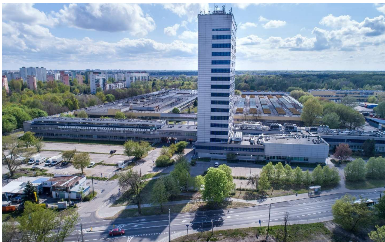
CeMat Complex, Wólczyńska 133, Bielany, Warsaw