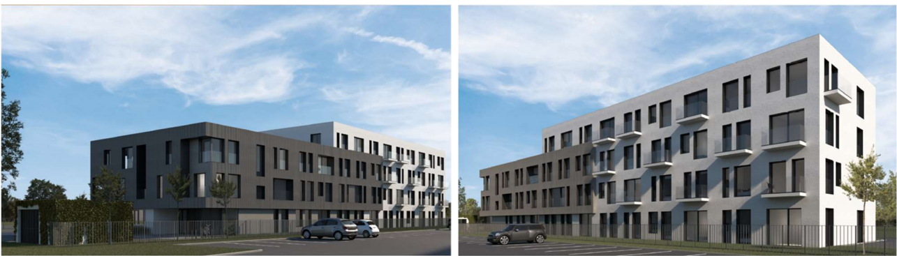
Concept visualisation, Wólczyńska 133, Warsaw, Poland

After obtaining the individual zoning decision, CeMat has started pre-development and design work in order to obtain the building permit. The goal is to get a building permit and start the pre-development work of media connections in 2023.